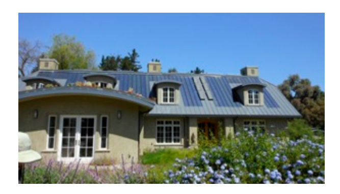
Sustainable home features solar panels and a living roof

Please join GreenTown Los Altos on Sunday, September 18 from 4pm – 6pm for wine and cheese at a private, sustainably designed, energy- and water-efficient home in Los Altos Hills.