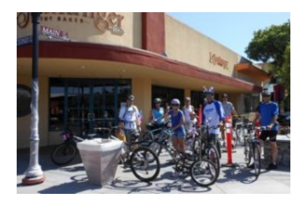
Riders gather for the July 2nd ride,